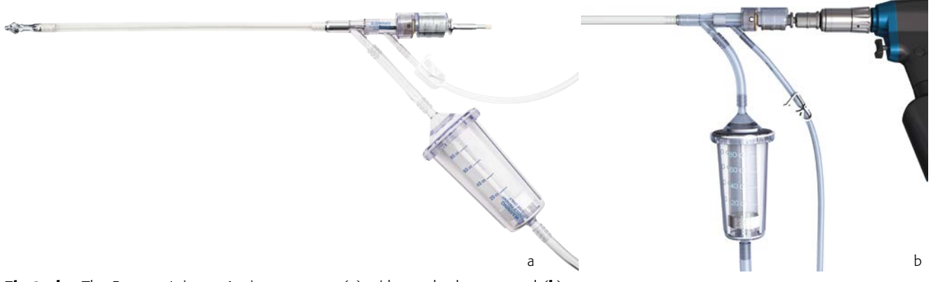
Fig 1a-b The Reamer Irrigator Aspirator system ( a ) with attached power tool ( b ).

A power drill that provides 3.5–4.5 Nm of torque and 700–900 RPMs is recommended.